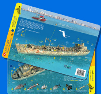
FLO08 Waterproof plastic card 5.5 x 8.5 inch Lady Luck Florida Broward County