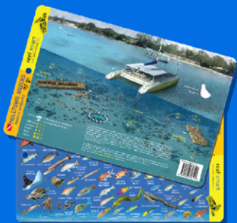
BDS06 Waterproof plastic card 5.5 x 8.5 inch Holetown Wrecks Barbados