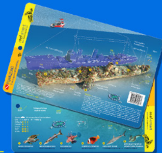
TKL01 Waterproof plastic card 5.5 x 8.5 inch Fumizuki Destroyer Truk Lagoon