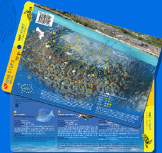
BON03 Waterproof plastic card 5.5 x 8.5 inch 1000 Steps Bonaire