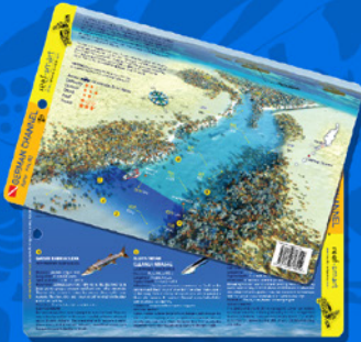
PAL03 Waterproof plastic card 5.5 x 8.5 inch German Channel Palau