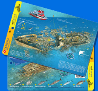
NCA03 Waterproof plastic card 5.5 x 8.5 inch Caribsea North Carolina