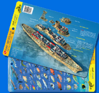
FLK04 Waterproof plastic card 5.5 x 8.5 inch Duane / Bibb Deck Plan Florida Keys