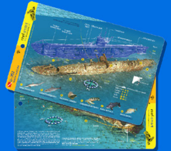
NCA01 Waterproof plastic card 5.5 x 8.5 inch U-352 North Carolina