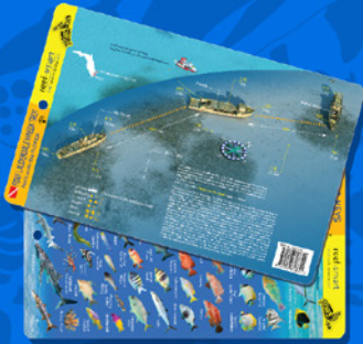
FLO14 Waterproof plastic card 5.5 x 8.5 inch Fort Lauderdale Wreck Trek Florida Broward County