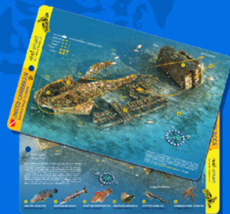
FLO04 Waterproof plastic card 5.5 x 8.5 inch United Caribbean / Wreck Trek Boca Florida Broward County