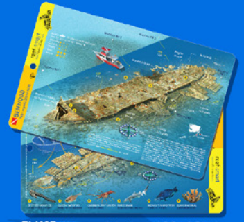
FLK07 Waterproof plastic card 5.5 x 8.5 inch Benwood Florida Keys