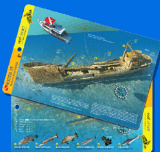
FLO09 Waterproof plastic card 5.5 x 8.5 inch Rodeo 25 Florida Broward County