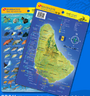
BDS11 Waterproof plastic card 5.5 x 8.5 inch Barbados island Barbados