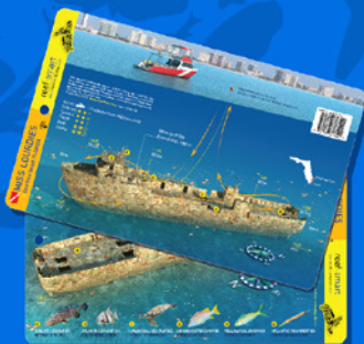
FLO03 Waterproof plastic card 5.5 x 8.5 inch Miss Lourdes / Miracle of Life Florida Broward County