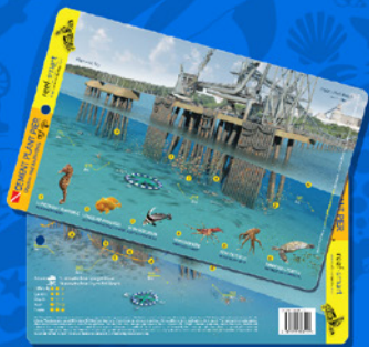
BDS02 Waterproof plastic card 5.5 x 8.5 inch Cement Plant Pier Barbados