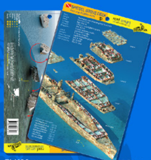
FLK06 Waterproof plastic card 5.5 x 8.5 inch Spiegel Grove Deck Plan Florida Keys