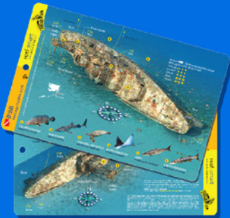
FLK03 Waterproof plastic card 5.5 x 8.5 inch Bibb Florida Keys