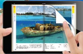
BDS13 eBook Barbados dive, snorkel and surf guide eBook Barbados