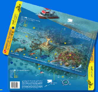
FLK01 Waterproof plastic card 5.5 x 8.5 inch Christ of the Deep / Dry Rocks Florida Keys