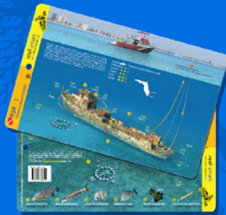
FLO12 Waterproof plastic card 5.5 x 8.5 inch RSB 1 Florida Broward County