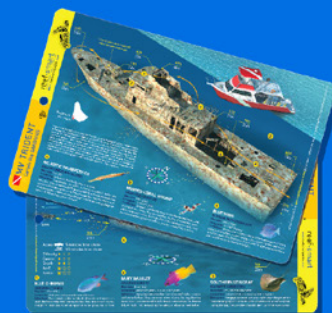
BDS10 Waterproof plastic card 5.5 x 8.5 inch Trident Barbados