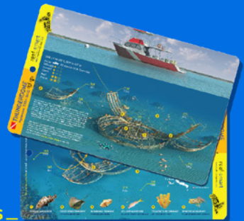
TAC01 Waterproof plastic card 5.5 x 8.5 inch Thunderdome Turks & Caicos