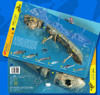
FLK11 Waterproof plastic card 5.5 x 8.5 inch Eagle Florida Keys