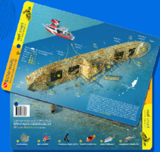
PAL06 Waterproof plastic card 5.5 x 8.5 inch Bichu Maru Palau