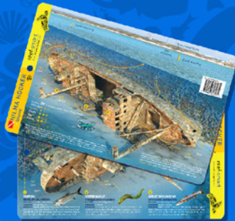
BON01 Waterproof plastic card 5.5 x 8.5 inch Hilma Hooker Bonaire