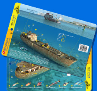
BDS09 Waterproof plastic card 5.5 x 8.5 inch Brianna H Barbados