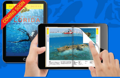
FLO16 eBook Florida Broward County dive, snorkel and surf guide eBook Florida Broward County