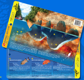
PAL01 Waterproof plastic card 5.5 x 8.5 inch Chandelier Cave Palau