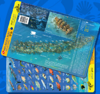
FLK10 Waterproof plastic card 5.5 x 8.5 inch Molasses Reef Florida Keys