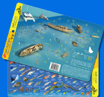
BDS08 Waterproof plastic card 5.5 x 8.5 inch Carlisle Bay Barbados