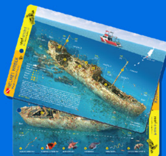
PAL07 Waterproof plastic card 5.5 x 8.5 inch Helmet Wreck Palau