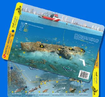
FLO07 Waterproof plastic card 5.5 x 8.5 inch Ancient Mariner / Deerfield Wreck Trek Florida Broward County