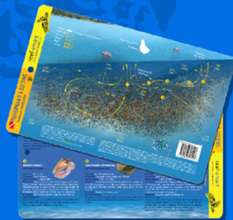
BDS04 Waterproof plastic card 5.5 x 8.5 inch Fisherman's & Dottins Barbados