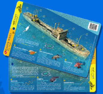
PAL02 Waterproof plastic card 5.5 x 8.5 inch Chuyo Maru Palau