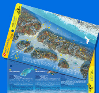
BON08 Waterproof plastic card 5.5 x 8.5 inch Invisibles Bonaire