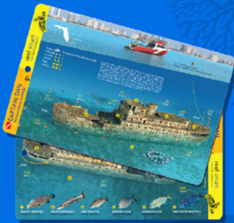
FLO11 Waterproof plastic card 5.5 x 8.5 inch Captain Dan Florida Broward County