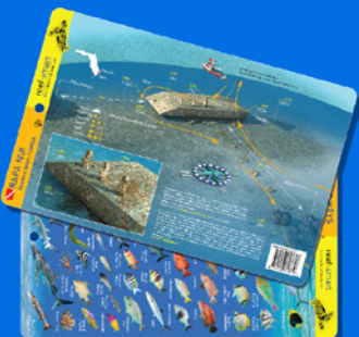
FLO06 Waterproof plastic card 5.5 x 8.5 inch Rapa Nui Florida Broward County