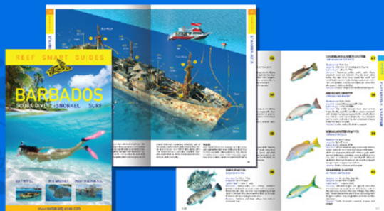
BDS01 Book, 5.5 x 8.5 inch, 184 pages Barbados dive, snorkel and surf guide book Barbados