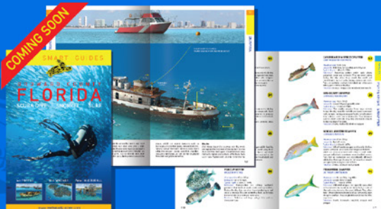
FLO16 Book, 5.5 x 8.5 inch, 184 pages Florida Broward County dive, snorkel and surf guide book Florida Broward County