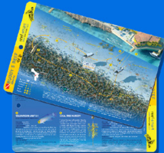
BON04 Waterproof plastic card 5.5 x 8.5 inch Buddy's Reef Bonaire