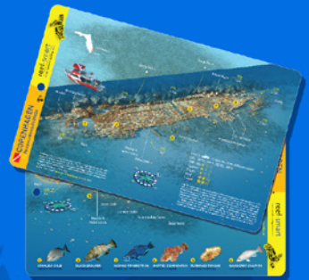
FLO13 Waterproof plastic card 5.5 x 8.5 inch Copenhagen Florida Broward County