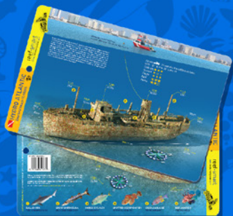
FLO02 Waterproof plastic card 5.5 x 8.5 inch Hydro Atlantic Florida Broward County