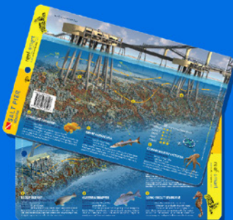
BON07 Waterproof plastic card 5.5 x 8.5 inch Salt Pier Bonaire