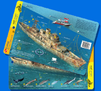
FLK02 Waterproof plastic card 5.5 x 8.5 inch Duane Florida Keys