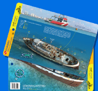
FLO10 Waterproof plastic card 5.5 x 8.5 inch Okinawa Florida Broward County