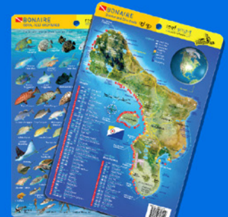
BON09 Waterproof plastic card 5.5 x 8.5 inch Bonaire island Bonaire