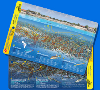
BON05 Waterproof plastic card 5.5 x 8.5 inch Bachelor's Beach Bonaire