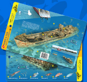
BDS03 Waterproof plastic card 5.5 x 8.5 inch Pamir & Sub Barbados