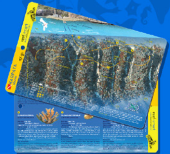
BON02 Waterproof plastic card 5.5 x 8.5 inch Karpata Bonaire