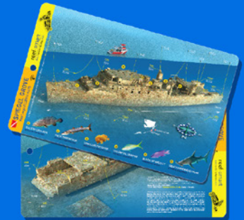
FLK05 Waterproof plastic card 5.5 x 8.5 inch Spiegel Grove Florida Keys