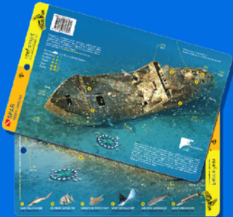
NCA02 Waterproof plastic card 5.5 x 8.5 inch Spar North Carolina