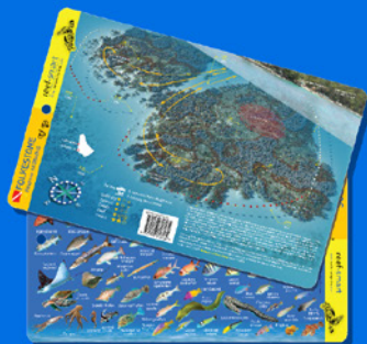
BDS05 Waterproof plastic card 5.5 x 8.5 inch Folkestone Reef Barbados