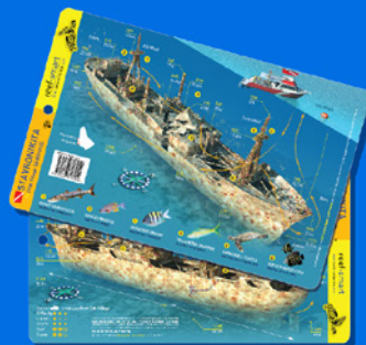
BDS07 Waterproof plastic card 5.5 x 8.5 inch Stavronikita Barbados