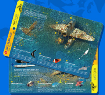
PAL05 Waterproof plastic card 5.5 x 8.5 inch Jake Seaplane Palau