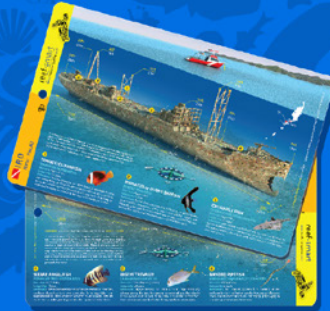
PAL04 Waterproof plastic card 5.5 x 8.5 inch Iro Palau